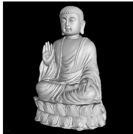
3D representation of a sculpture scanned with CT.

Are you wondering how your object is constructed or if there might be other artifacts hidden inside the object? Or do you simply want to record the 3D structure with internal geometries? By means of computer tomography this is possible, of course always depending on the material and the geometry of the object.