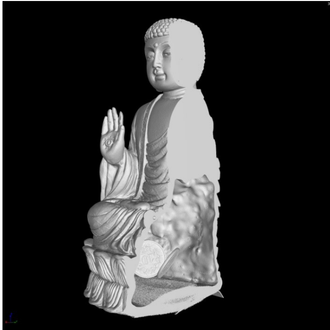
Digital "sliced" model

In addition to the three-dimensional representation of the visible surface, it is also possible to display the inner structure and composition, which is usually hidden to the eye, in sectional images. For example, materials can be differentiated on the basis of their gray values and one gets a completely new impression of the object.