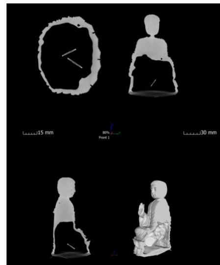
CT scan of a sculpture; bottom right: sliced open Solid model: top left and right: cross-sectional images through the sculpture