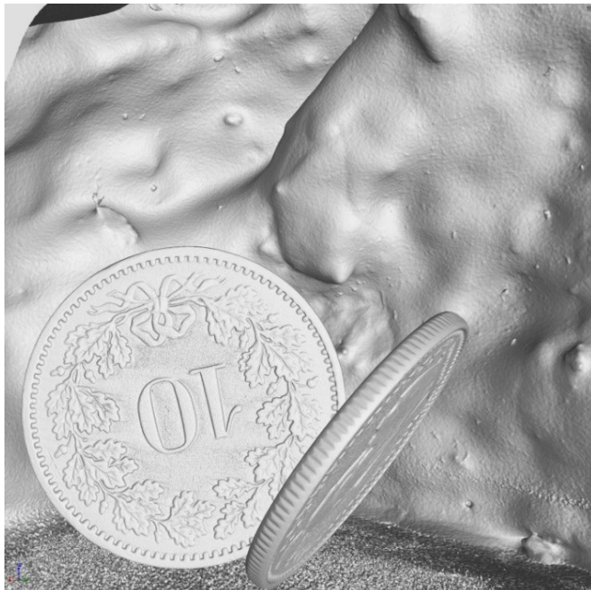
Details from the interior of the object